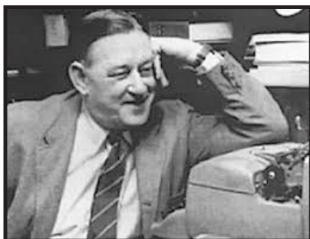
Pottsville native John O'Hara