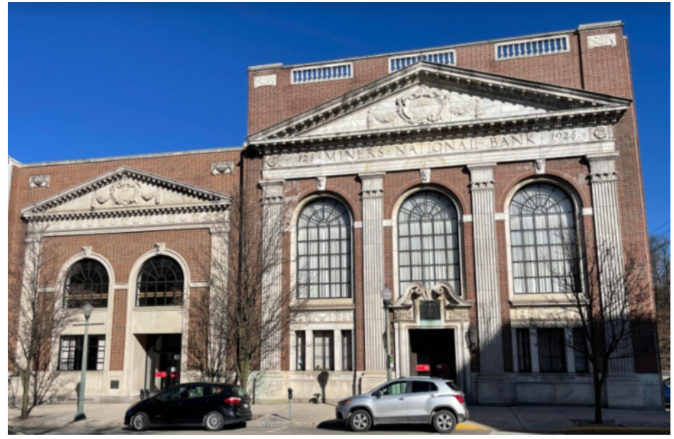
(Above) The former Miners National Bank building in 2023, when Santander Bank occupied it, and (right) the building that it replaced in 1927.