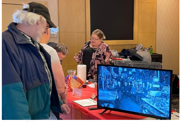
A 2022 fairgoer watches a slideshow at our booth.

Led by the Society, the Schuylkill County Coalition of Historical Societies, is hoping this year's fair will be even more successful than last year, when our 27 exhibits drew huge crowds.