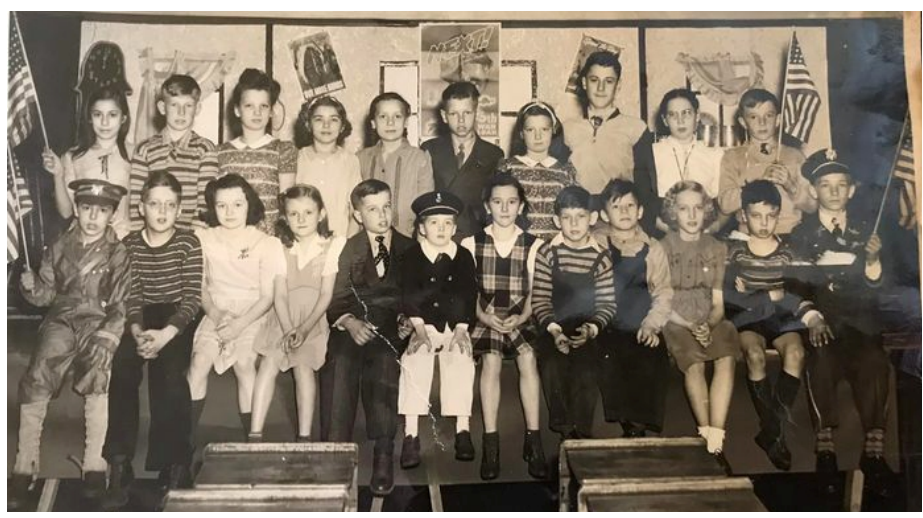
Students at Rahn Township's Owl Creek School in approximately 1945.

In 1962, the Rahn school board reversed course. That fall, its students, as well as those