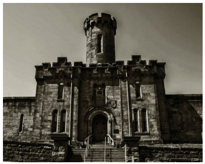
Schuylkill County Prison, just one reportedly haunted place you'll see on the downtown Pottsville tour.

The Society is taking reservations now. Reserve your spot soon because space is limited!