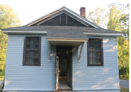
Top: Volunteers unload slate blackboards. Lower left: The original Stanhope School bell. Lower right: The Stanhope School building.

We will also collect information about the former students and their families, as well as the historical events that took place during that time.