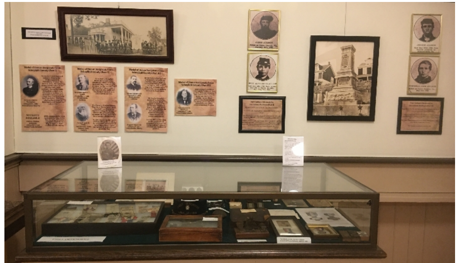
One of several displays in our Civil War Room

Our purpose is to discover, procure and preserve the historical records, data and other relevant materials of Schuylkill County.