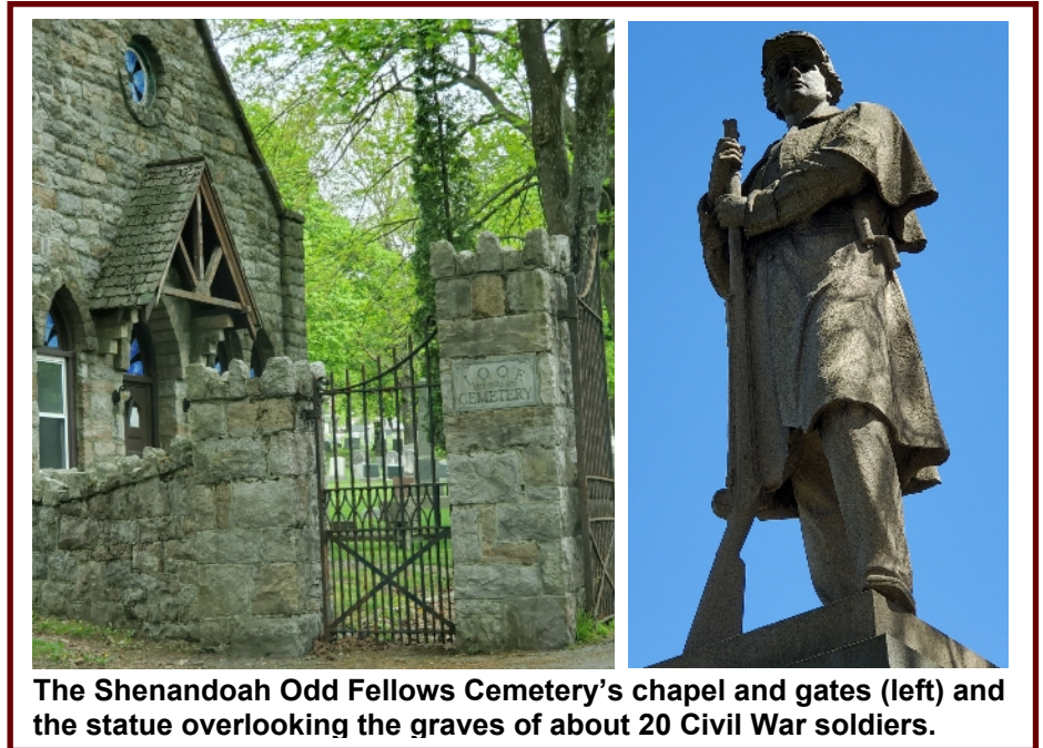
The Shenandoah Odd Fellows Cemetery's chapel and gates (left) and the statue overlooking the graves of about 20 Civil War soldiers.

Notable markers include two World War II cenotaphs, which are markers with no physical burial. One is for a sailor buried at sea. The other